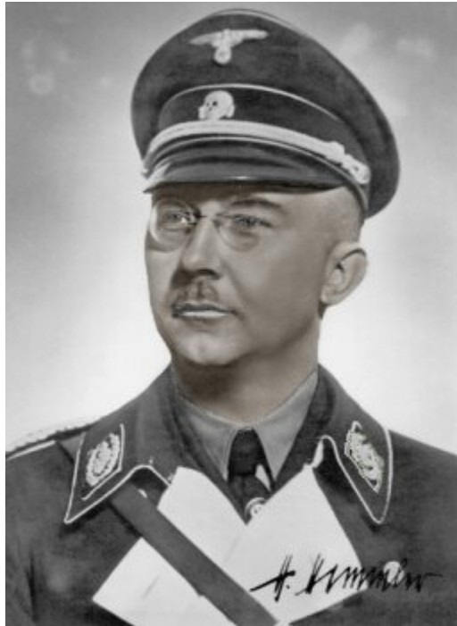
Reichsführer Heinrich Himmler 1900-1945 Satanic Coven Grand Master Dedicated Disciple of Satan

This text is dedicated in loving memory to